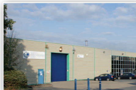
Distribution Centre, Ashford