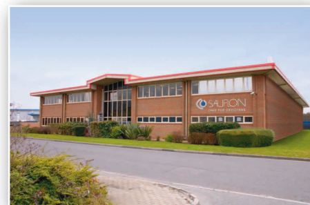
Lens Production, Fareham

In both contact lens production facilities Sauflon employ the same highly sophisticated robotic manufacturing platform which allows for the start-up manufacturing and R&D in Southampton to be transferred seamlessly to a high volume process in Hungary. Producing all lens types on the same platform also allows for greater flexibility in meeting the varying demands from a global customer base.