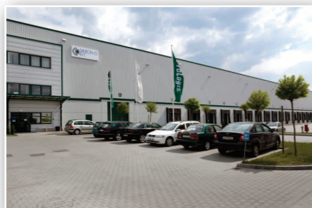
Lens Production, Hungary